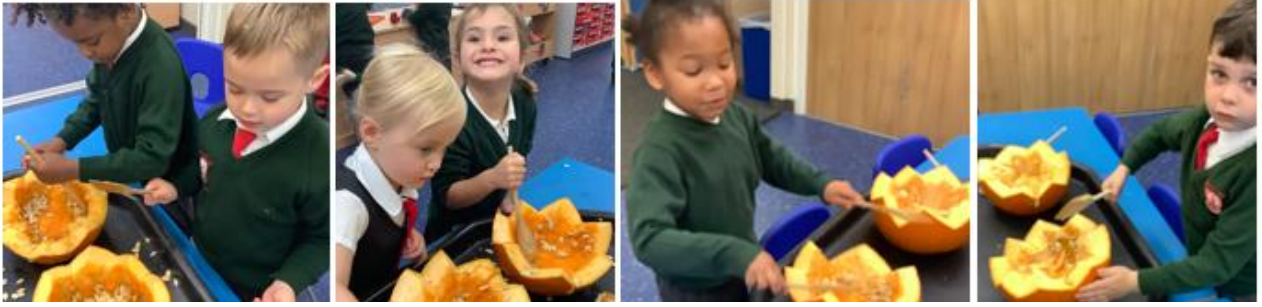
Y1 celebrated St Margaret Mary's Feast Day and learned about her life.