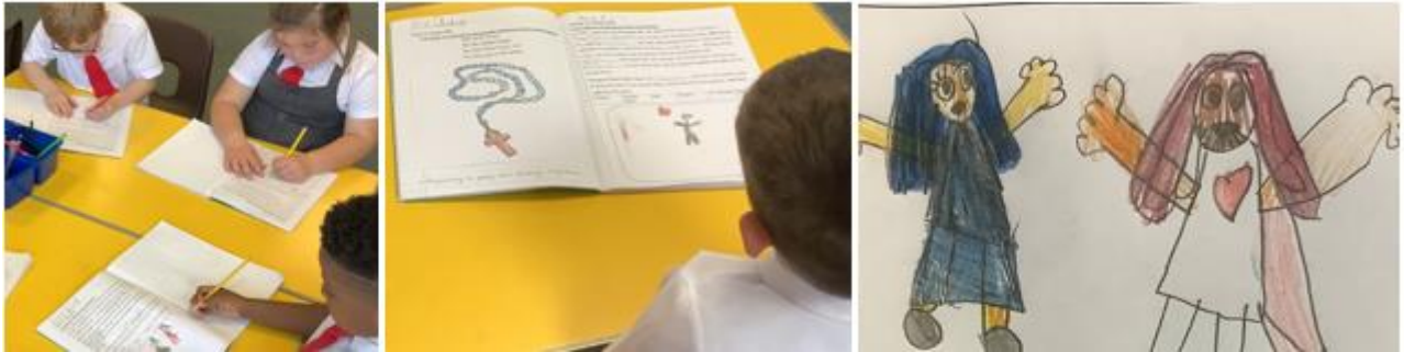
Y1/2 led the assembly this week; it was about All Saints' Day.