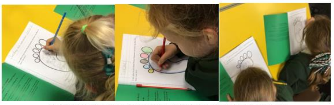
Y2 have enjoyed using different resources to make two-digit numbers.

Y1/2 have discussed the school mission statement and shared how they can live it each day.