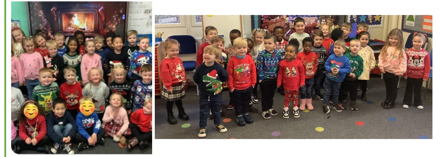
1/2M have been practising grouping and sharing this week in Maths ...